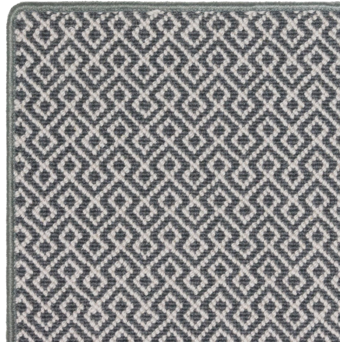
Gala Lattice Basalt with Microstitch