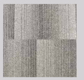
Vibe, 810820 (LRV - 8.04)