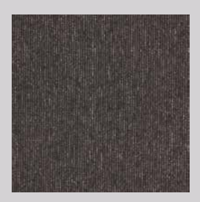
Jet / Quartz, 821101 (LRV - 3.82)