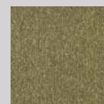
Spearmint, 318101 (LRV - 9.89)