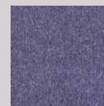
Blue Candy, 501458 (LRV - 7.23)