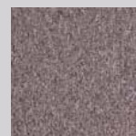
Humbug, 101171 (LRV - 12.76)