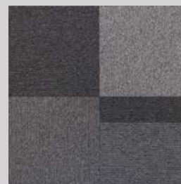
Palladium Sky, 91826 (LRV - 3.74)