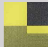
Black Leaf, 52926 (LRV - 11.81)