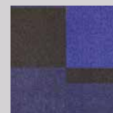
Ocean Rocks, 64518 (LRV - 3.01)