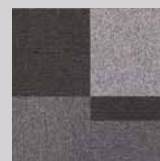
Chrome Pelt, 83126 (LRV - 8.51)