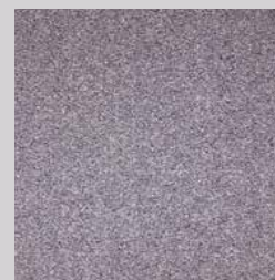
Steel Grey, 8031C (LRV - 11.62)